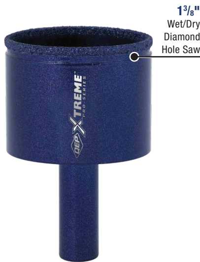
1 3/8" Wet/Dry Diamond Hole Saw

10087 / 10087-8 / 10080 / 10080-8 / 10075 / 10075-8 / 10071