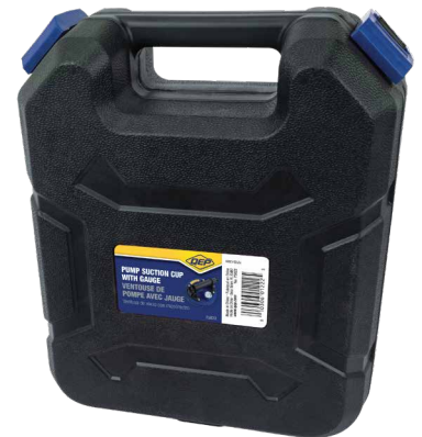
CONVENIENT Protective carry case