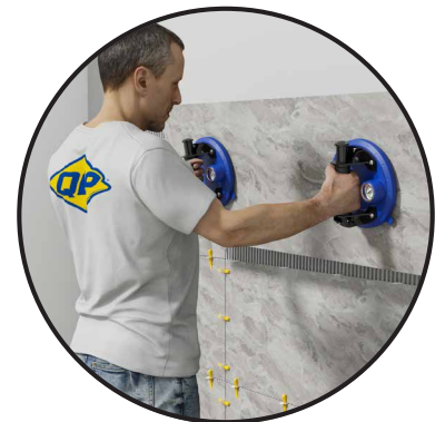
MAKES HEAVY LIFTING EASY

The QEP® 8" Vacuum Pump with Suction Cup with Gauge makes heavy lifting easy. This hand held portable suction cup has a holding power of 285 lbs. It can be used to lift large tiles, stone, glass and all types of non-porous building material. To use, pump plunger until red line disappears and suction is engaged. During use, red line should not be visible. Gauge safety feature indicates insufficient pressure. Release valve is located on opposite end of plunger. Store with protector cover (included) in durable carrying case.