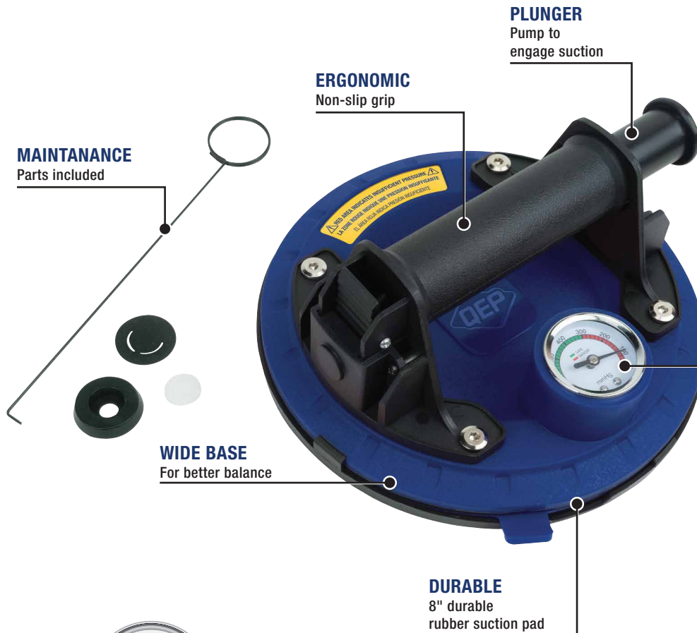
GAUGE Red indicates insufficient pressure