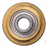
21178 (Sold Separately)

LIGHTWEIGHT Only 5-1/2" wide and lighter than any other cutters on the market for easy transport to the job site