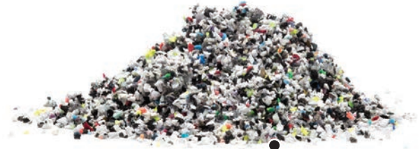
RECYCLED EVA FOAM