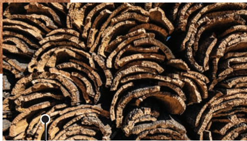
CORK REMOVED FROM TREES