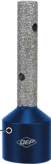
10052 3/4" Diamond Milling Bit